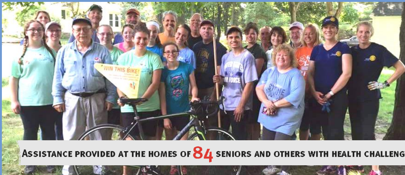
ASSISTANCE PROVIDED AT THE HOMES OF 84 SENIORS AND OTHERS WITH HEALTH CHALLENGES