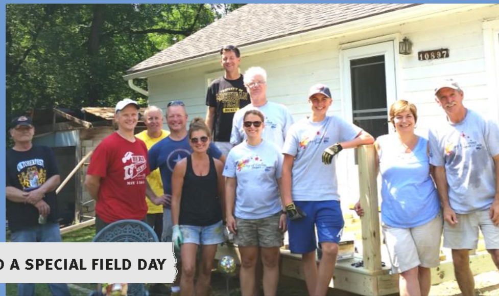
40 DISABLED ADULTS ENJOYED A SPECIAL FIELD DAY