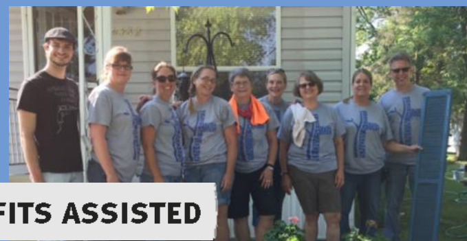
20 NONPROFITS ASSISTED