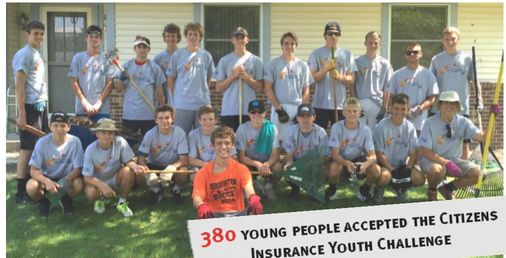
380 YOUNG PEOPLE ACCEPTED THE CITIZENS INSURANCE YOUTH CHALLENGE